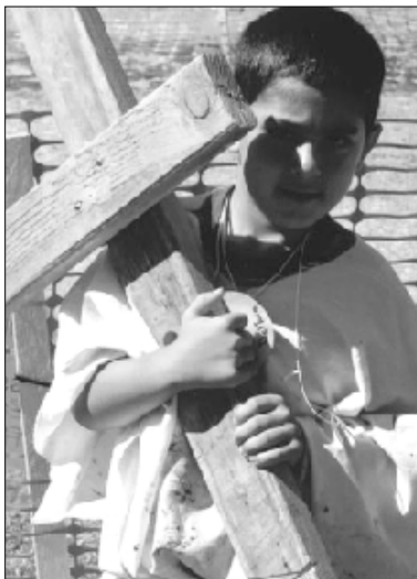
The Cross of Jesus became real for this boy

The project raised excitement at Petaluma UMC. "I had more adults participating from my